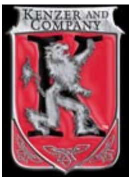
If I Were a Rich Man